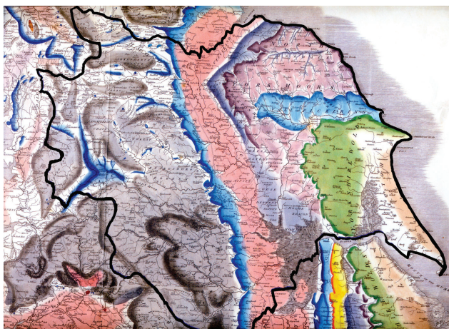
A section of Smith's map, with Yorkshire outlined in black.

This beautiful new artwork – a 4m x 4m walk-on pebble mosaic – depicts the Yorkshire section of William Smith's famous geological map of 1815.